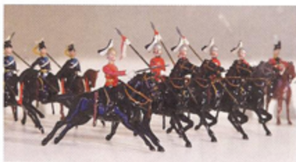
4TH - 7TH DRAGOONS (1727-1741)