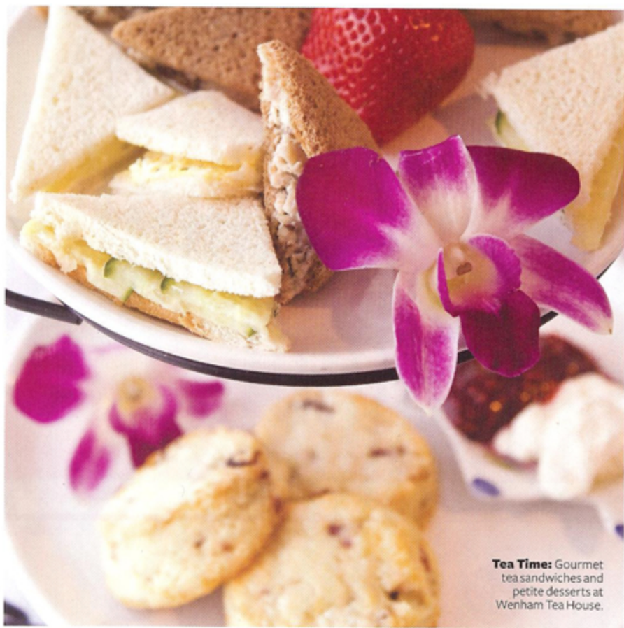
Tea Time: Gourmet tea sandwiches and petite desserts at Wenham Tea House.